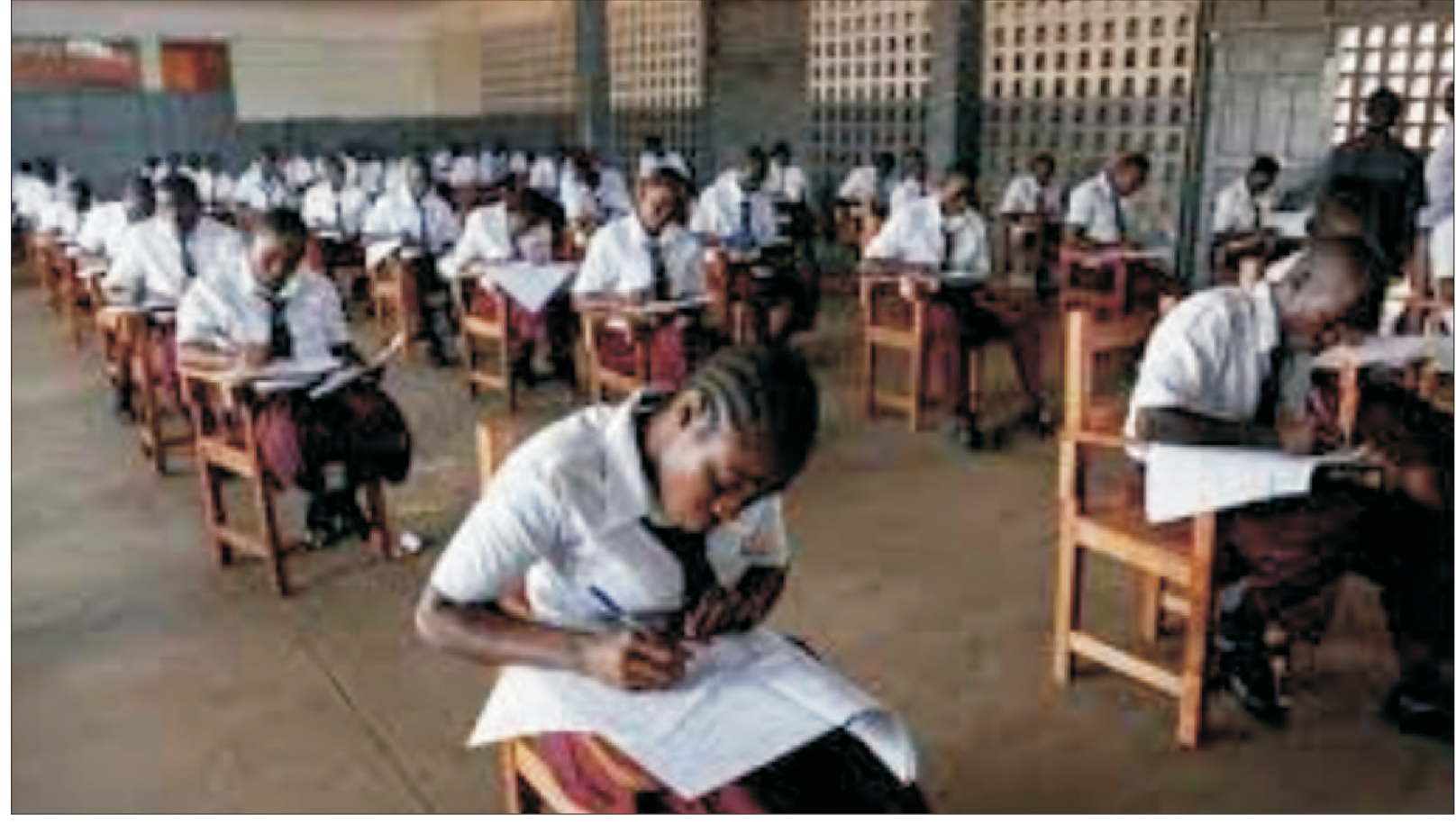
Secondary school students

Its conclusion: "Private schools are currently educating the majority of primary and secondary students in Lagos State. As such, Lagos is one of the largest private school